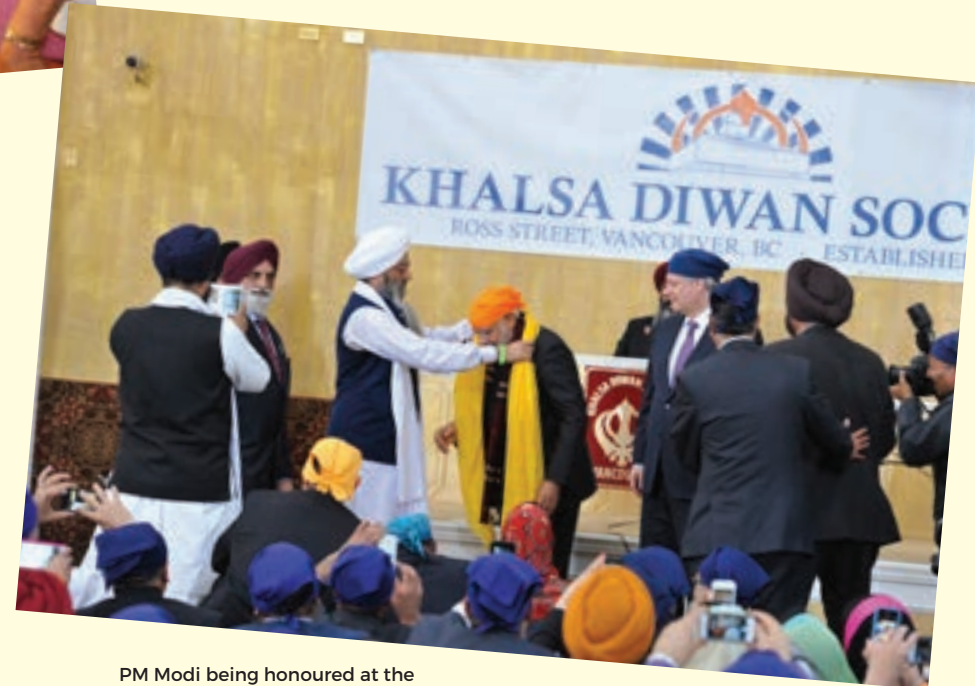
PM Modi being honoured at the Gurdwara Khalsa Diwan at Ross Street in Vancouver, Canada April 16, 2015