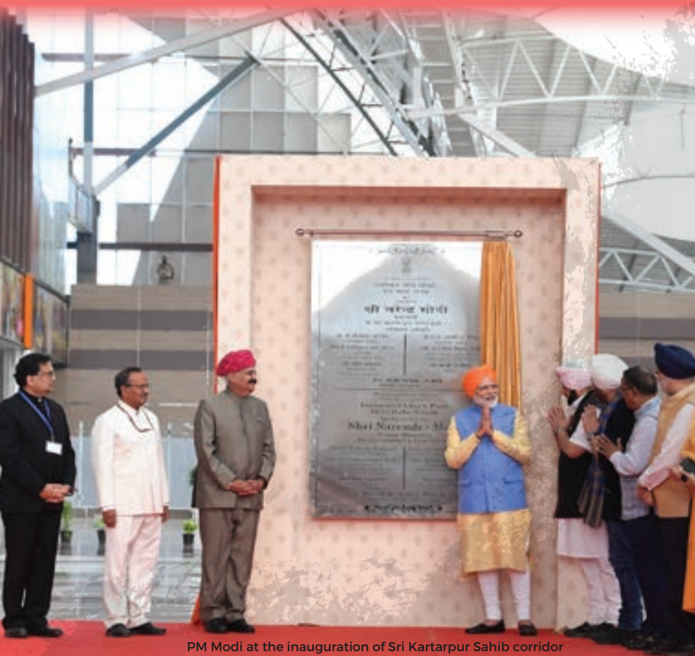
PM Modi at the inauguration of Sri Kartarpur Sahib corridor