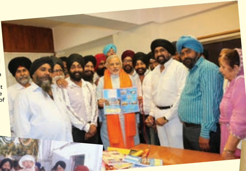
Narendra Modi being honoured by the Sikh community with a siropa at a community event during his tenure as Chief Minister of Gujarat