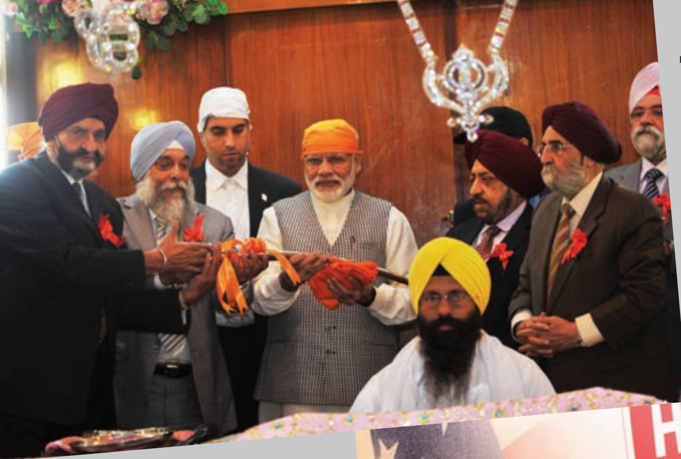
PM Modi being presented with Siropa and Kirpan at Bhai Ganga Singh Sabha Gurdwara, Tehran in 2016