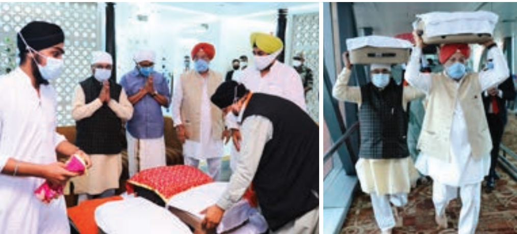
Copies of the holy Shri Guru Granth Sahib Ji being received at New Delhi airport