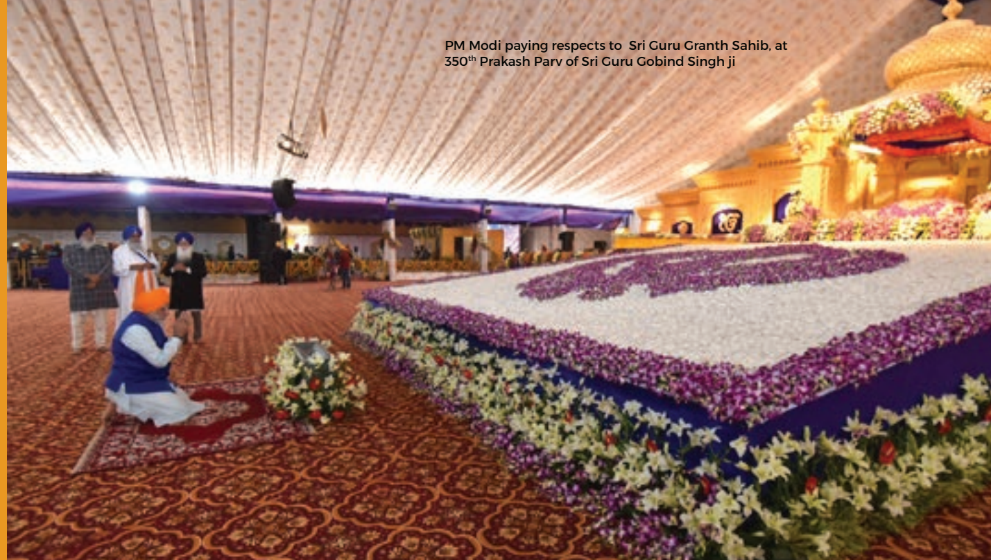
PM Modi paying respects to Sri Guru Granth Sahib, at 350 th Prakash Parv of Sri Guru Gobind Singh ji

Prime Minister Narendra Modi's special relationship with Sikhs has been seen in his personal gestures to the community and to the holy Gurus, as well as in his government's work empowering the Sikh community. He has paid great respect to the Sikh Gurus while he has always lauded the bravery, courage and spirit of enterprise of the Sikhs. With such a Prime Minister at the helm, no wonder that the government also has taken many institutional measures for the welfare of the Sikhs.