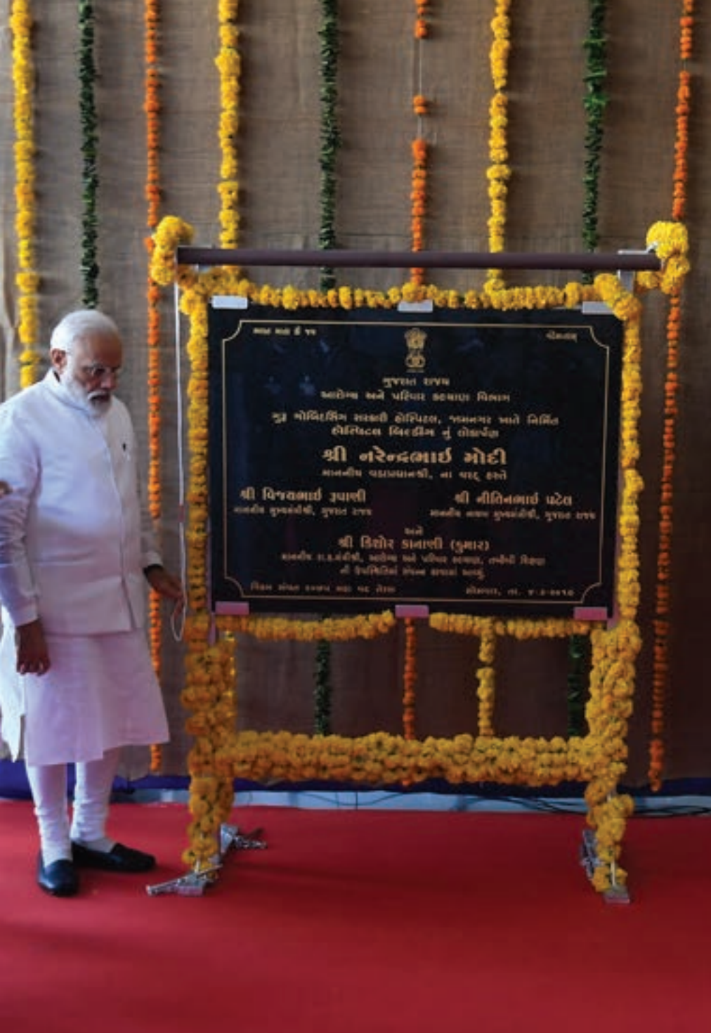
PM Modi inaugurating the Sri Guru Gobind Singh Hospital in Jamnagar, Gujarat

The Indian Railways spent almost ₹50 crore to improve facilities for pilgrims and travellers in key places associated with Sri Guru Gobind Singh Ji