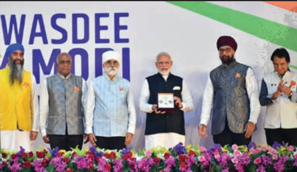
Prime Minister Narendra Modi released a commemorative coin marking the 550th birth anniversary of Shri Guru Nanak Dev Ji at the 'Sawasdee PM Modi' community event in Bangkok (November 2019)