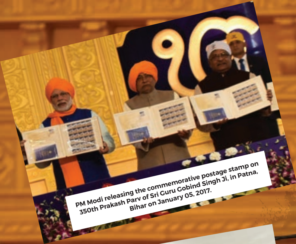
PM Modi releasing the commemorative postage stamp on 350th Prakash Parv of Sri Guru Gobind Singh Ji, in Patna, Bihar on January 05, 2017.