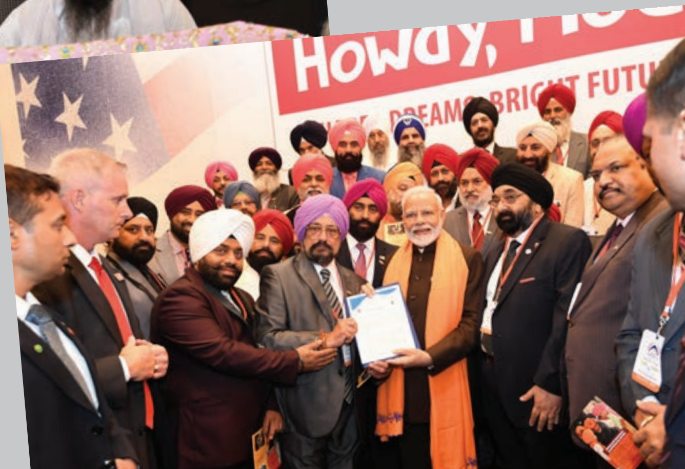
PM Modi honoured by the Sikh community in Houston during the 'Howdy, Modi' event, September 21, 2019