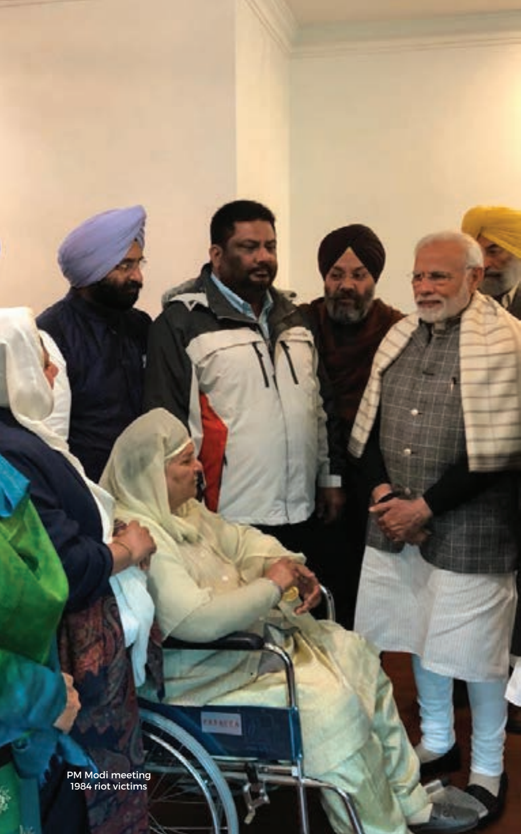
PM Modi meeting 1984 riot victims