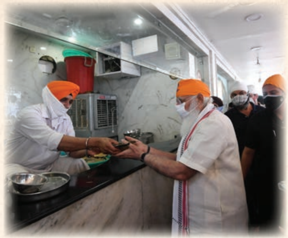
PM Modi prepares to offer prayers at the Gurudwara Sis Ganj Sahib, Delhi, May 1, 2021