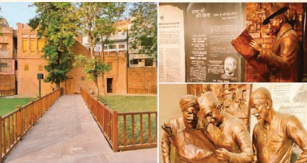
Renovated complex of Jallianwala Bagh Smarak, Amritsar

Jallianwala Bagh Smarak has been provided with several new and modern amenities, including illumination of strategic spots; and installation of audio nodes throughout the garden. Also, newer areas have been developed for housing the Salvation Ground, Amar Jyot and Flag Mast.