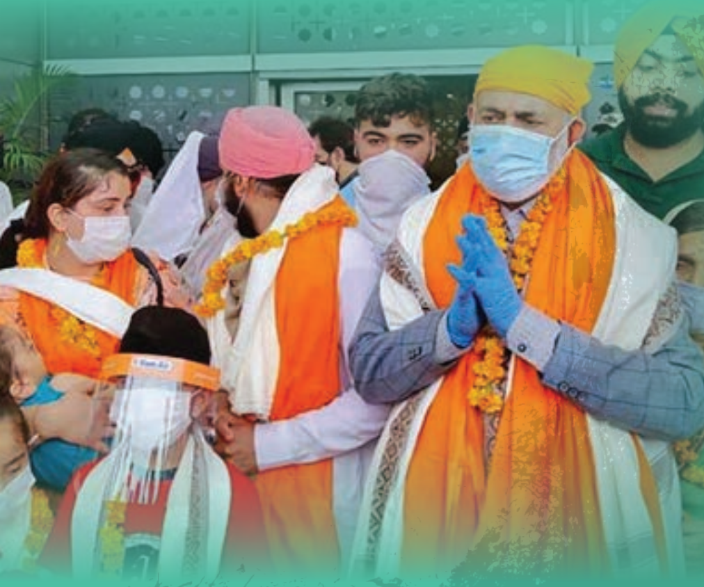
Sikhs from Afghanistan return to India, facilitated by Modi government