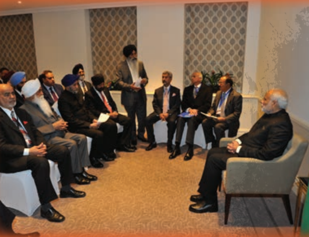
Sikh Delegation involving the Sikh Council, Nishkam Sewak Jatha, U.K.'s leading Gurdwara representatives, Councillors, Community, Charity, Voluntary Group representatives and Business Leaders met with PM Modi in 2015 during his London visit during which the issue of removing people from the 'blacklist', among others was raised. Modi government promptly got this done