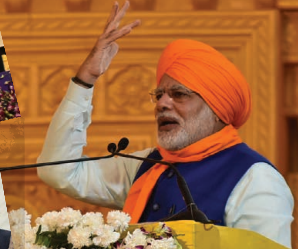
PM Modi addresses a gathering on the 350th Prakash Parv of Sri Guru Gobind Singh Ji