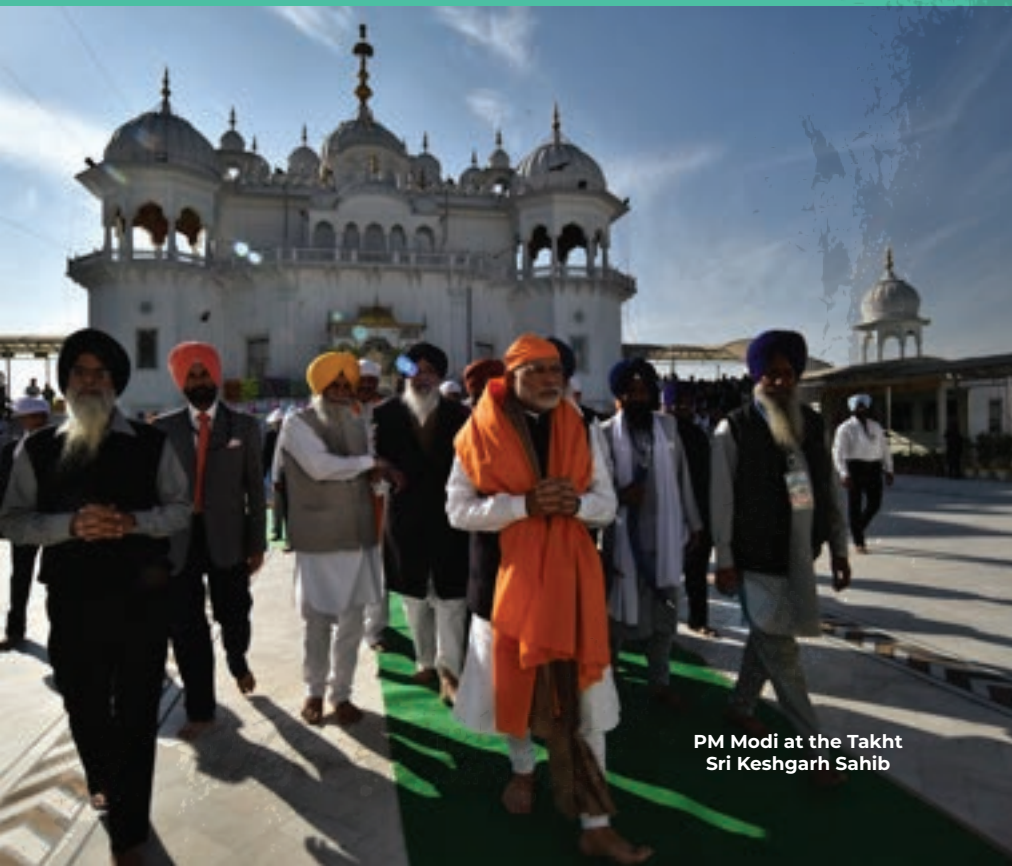
PM Modi at the Takht Sri Keshgarh Sahib

About 23.75 lakh borrowers received entrepreneur loans under MUDRA Scheme in Punjab in FY 2019-20 and FY 2020-21. It is well known that typically about 70% of beneficiaries of this scheme are women