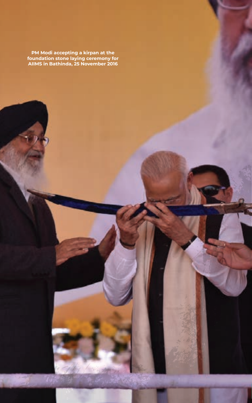
PM Modi accepting a kirpan at the foundation stone laying ceremony for AIIMS in Bathinda, 25 November 2016

This is also generating numerous jobs for skilled and semi-skilled workers