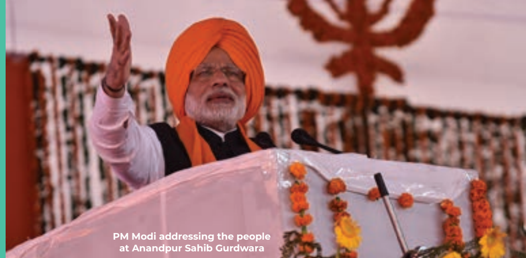
PM Modi addressing the people at Anandpur Sahib Gurdwara

India's first Technology and Innovation Support Centre is set up in the state of Punjab by the Modi government