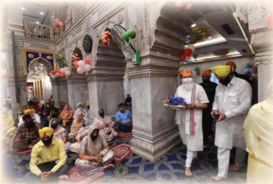
PM Modi prepares to offer prayers at the Gurudwara Sis Ganj Sahib, Delhi, May 1, 2021

“ We will be able to inspire humanity greatly if we can take the message to the whole world regarding how the Sikh community and millions of followers of our Gurus are following in their footsteps, how Sikhs are performing great social service and how our gurudwaras are the conscious centres of human service. ”