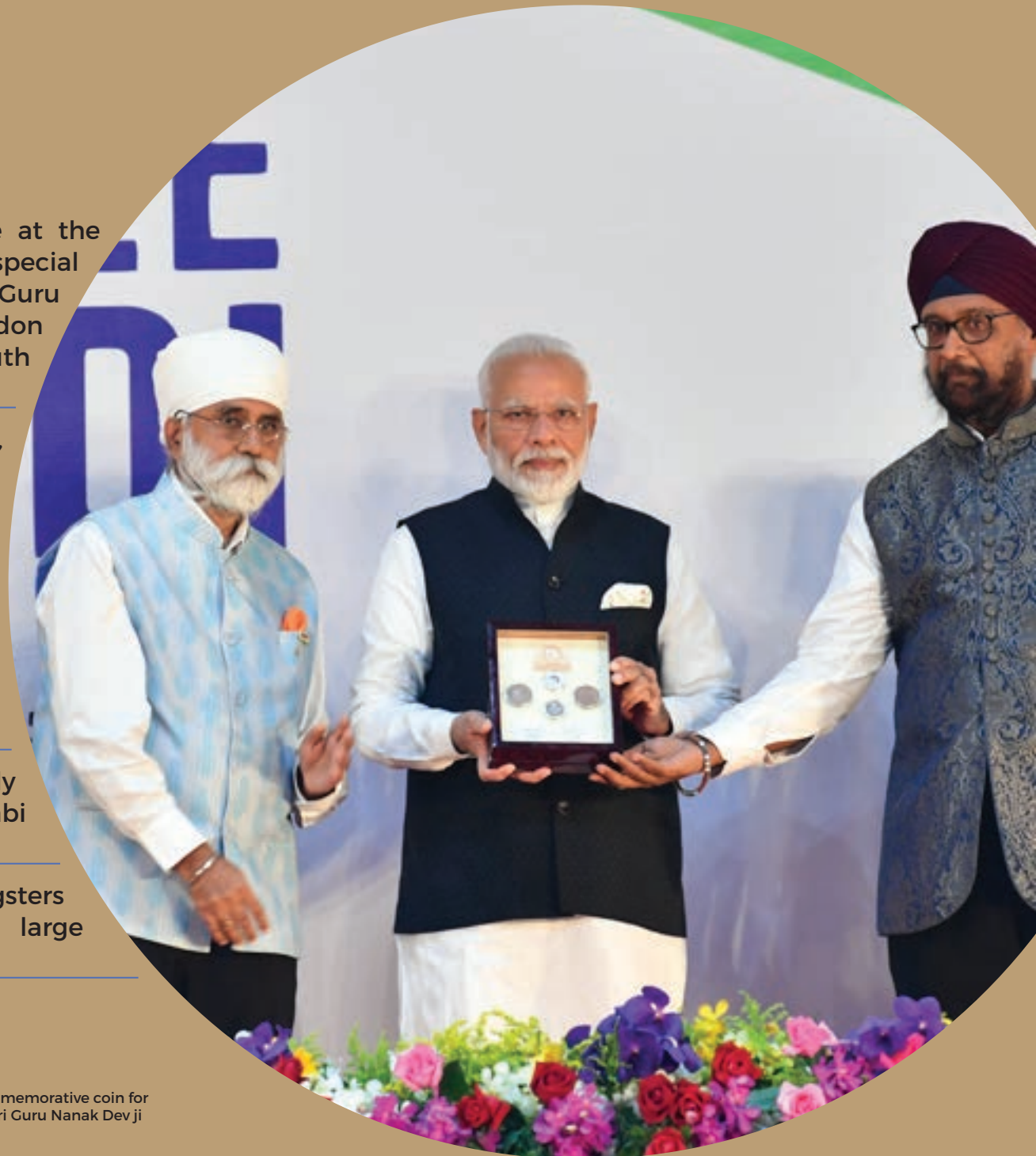
PM Modi releasing commemorative coin for 550th anniversary of Sri Guru Nanak Dev ji

What was noteworthy was that youngsters took part in these programmes in large numbers