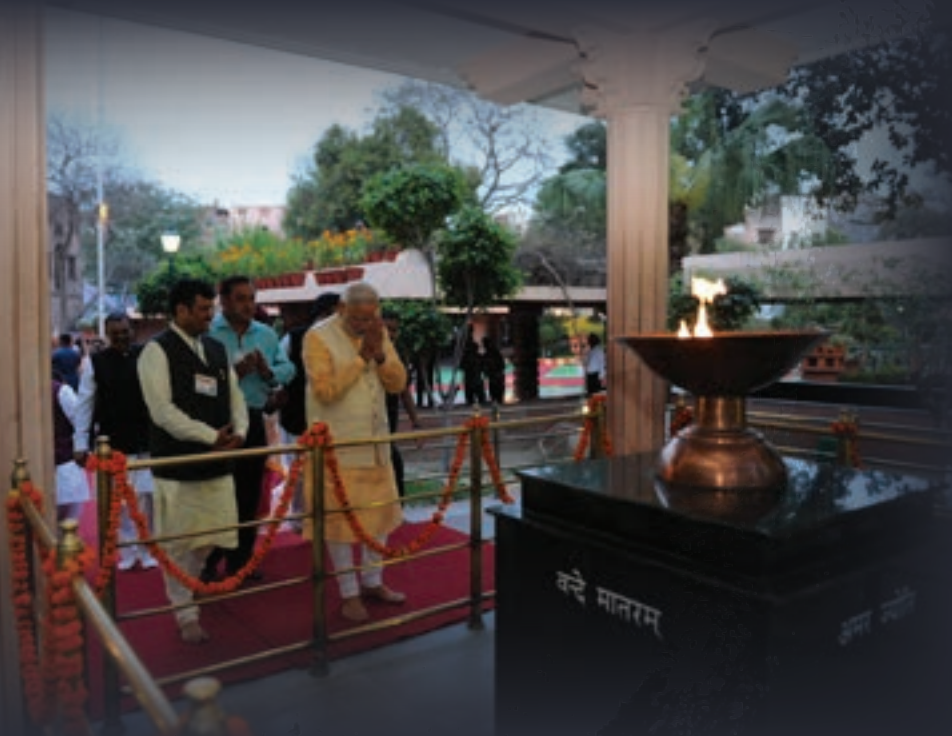
PM Modi at Jallianwala Bagh, Amritsar