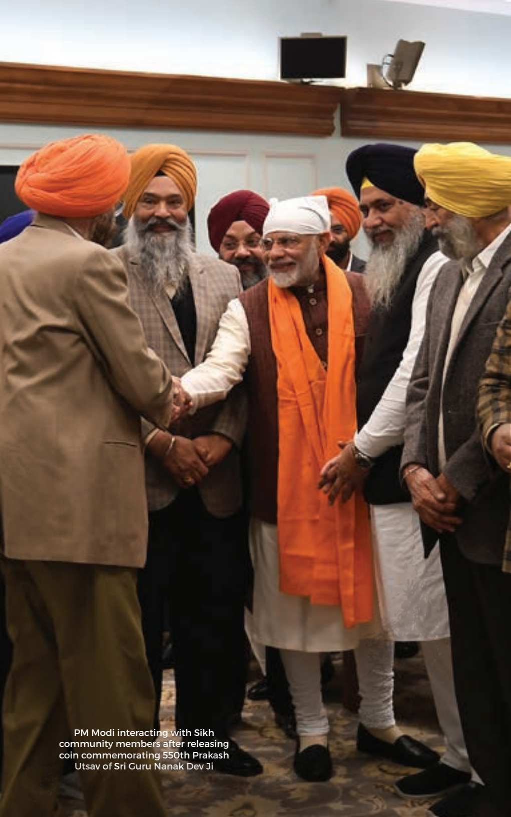
PM Modi interacting with Sikh community members after releasing coin commemorating 550th Prakash Utsav of Sri Guru Nanak Dev Ji

Further, the Modi government is leaving no stone unturned in promoting tourism to bring Sikh heritage live in front of people. For example, development of Anandpur Sahib - Fatehgarh Sahib - Chamkaur Sahib - Ferozpur - Amritsar - Khatkar Kalan - Kalanour - Patiala Heritage circuit under Swadesh Darshan scheme