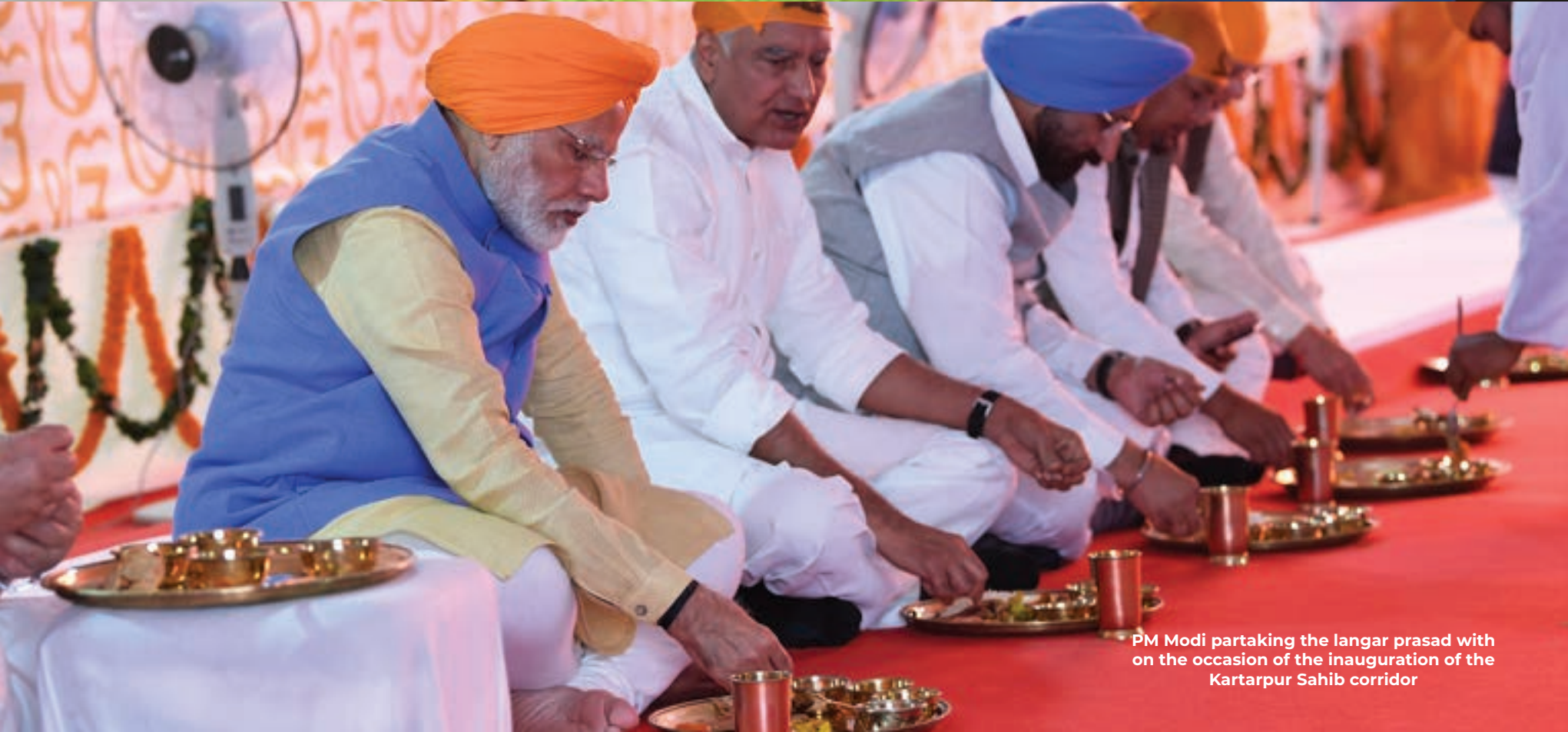
PM Modi partaking the langar prasad with on the occasion of the inauguration of the Kartarpur Sahib corridor