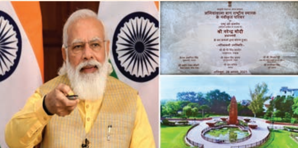
PM Modi dedicating the renovated Jallianwala Bagh Memorial to the nation, Amritsar, August 28, 2021

Prime Minister Sri Narendra Modi dedicated the renovated complex of Jallianwala Bagh Smarak to the nation on 28th August, 2021. He also inaugurated museum galleries developed at the Smarak.