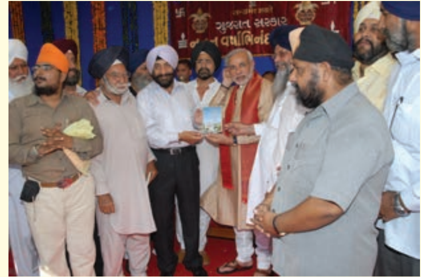
Narendra Modi accepting a memento from Sikh community representatives as Chief Minister of Gujarat during a Gujarati New Year function