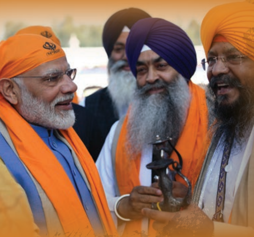
PM Modi with members of the Sikh community