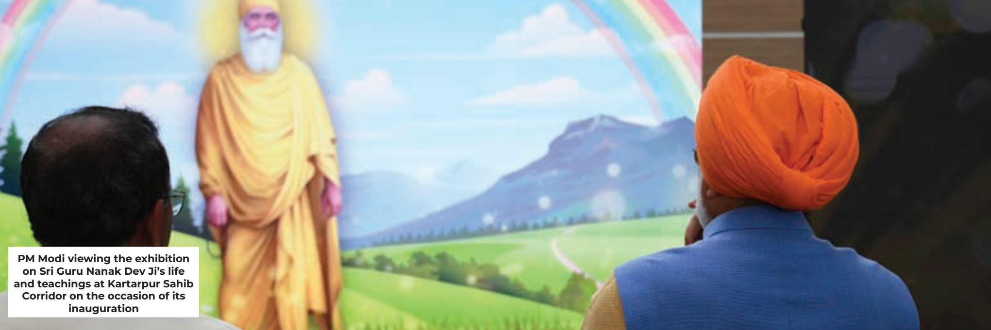
PM Modi viewing the exhibition on Sri Guru Nanak Dev Ji's life and teachings at Kartarpur Sahib Corridor on the occasion of its inauguration