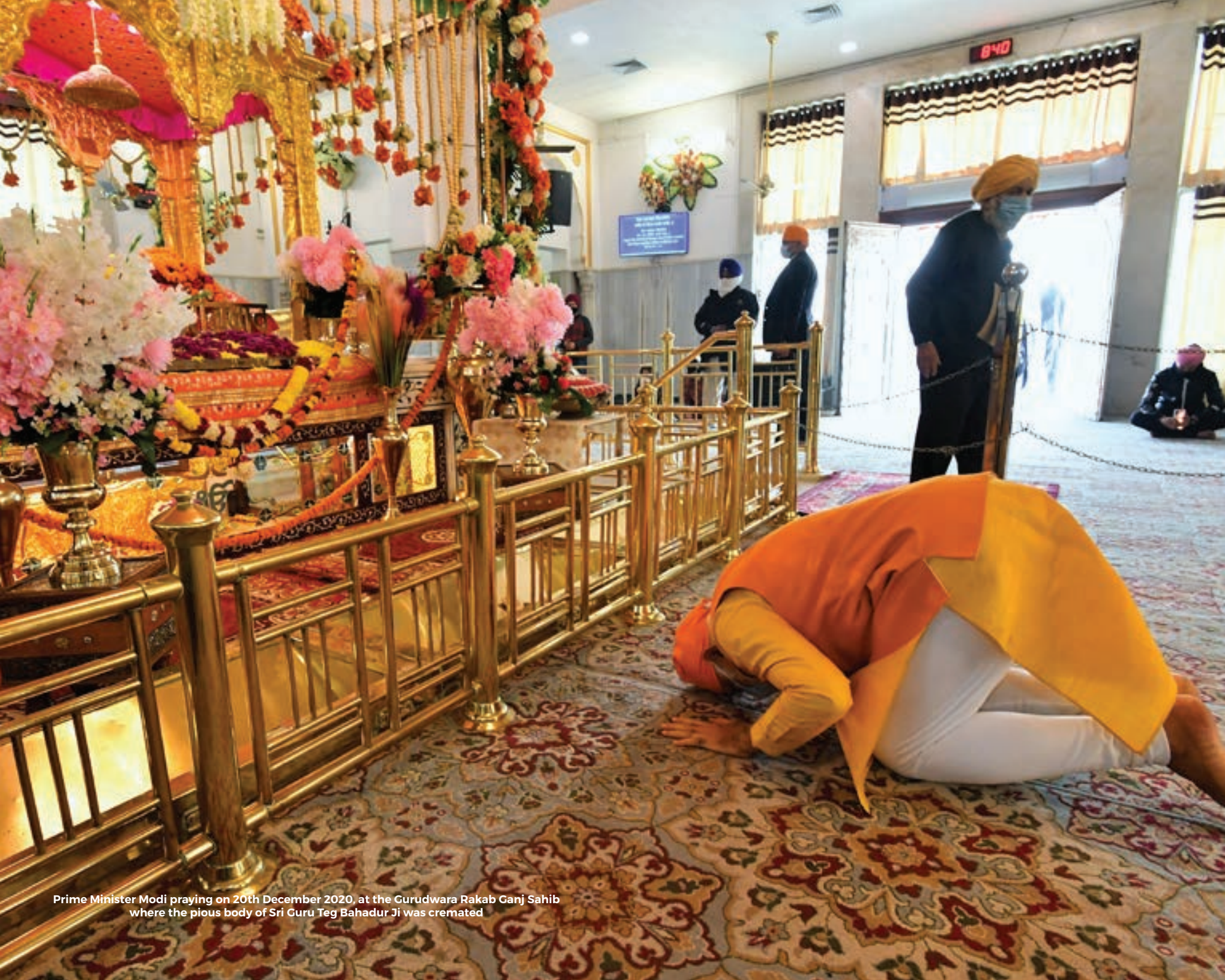
Prime Minister Modi praying on 20th December 2020, at the Gurudwara Rakab Ganj Sahib where the pious body of Sri Guru Teg Bahadur Ji was cremated