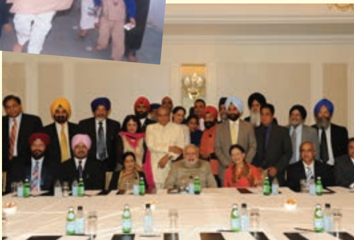
A group of Sikhs in New York, USA met PM Modi and expressed solidarity with him, September 28, 2014