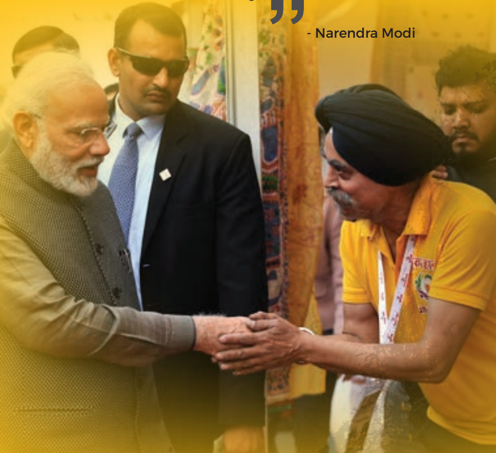
PM Modi with a Sikh artisan at Hunar Haat, New Delhi