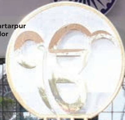
PM Modi at Sri Kartarpur Sahib Corridor