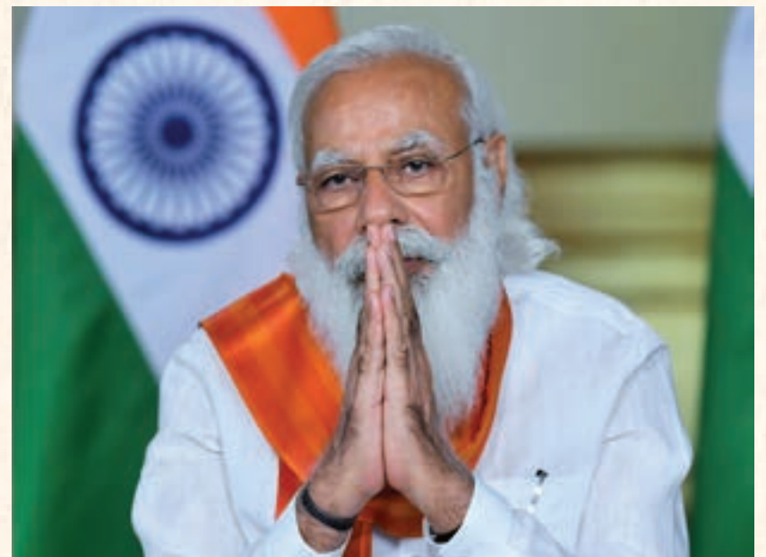
PM Modi addresses the gathering virtually during Sri Guru Tegh Bahadur Ji's 400th Prakash Parv, April 8, 2021