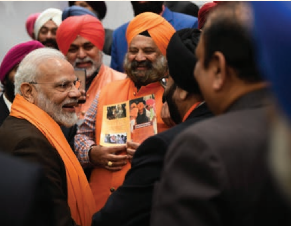
PM Modi interacting with Sikh diaspora members in Houston, Texas in 2019

However, it is not only prominent members of the Sikh diaspora for whom the Modi government has taken special steps