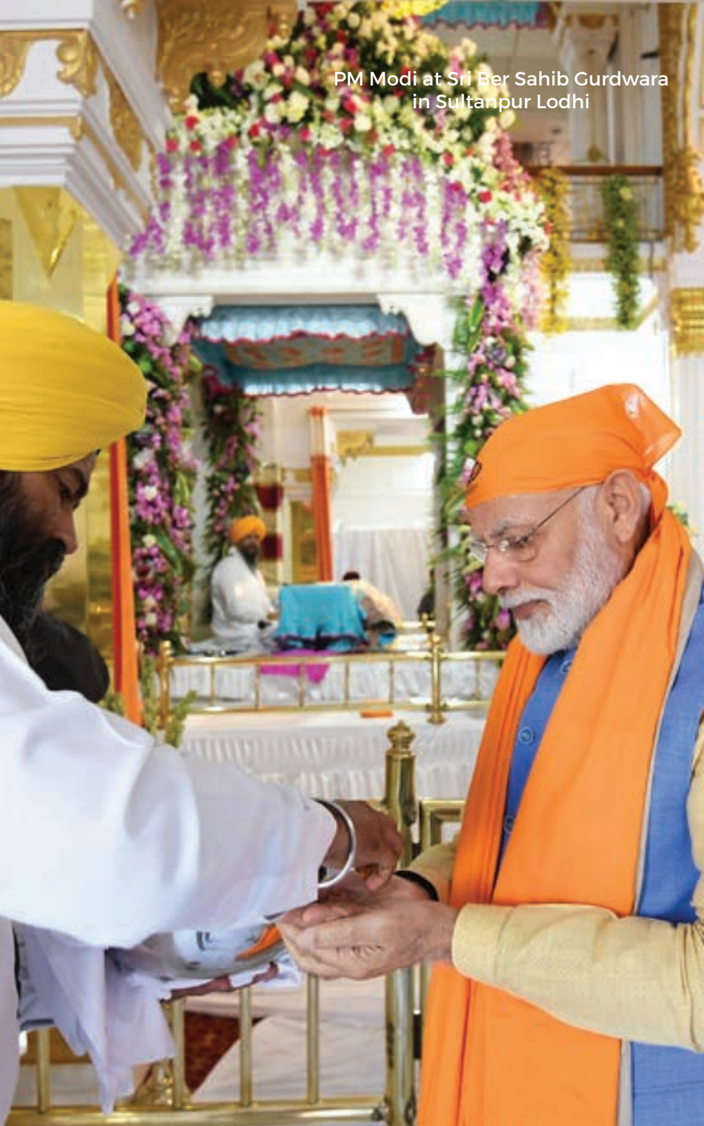
PM Modi at Sri Ber Sahib Gurdwara in Sultanpur Lodhi

Furthermore, the Guru Nanak Bani was published and released in Urdu, Odia, Marathi, Hindi and Gujarati. Work is underway to publish the same 15 other Indian languages