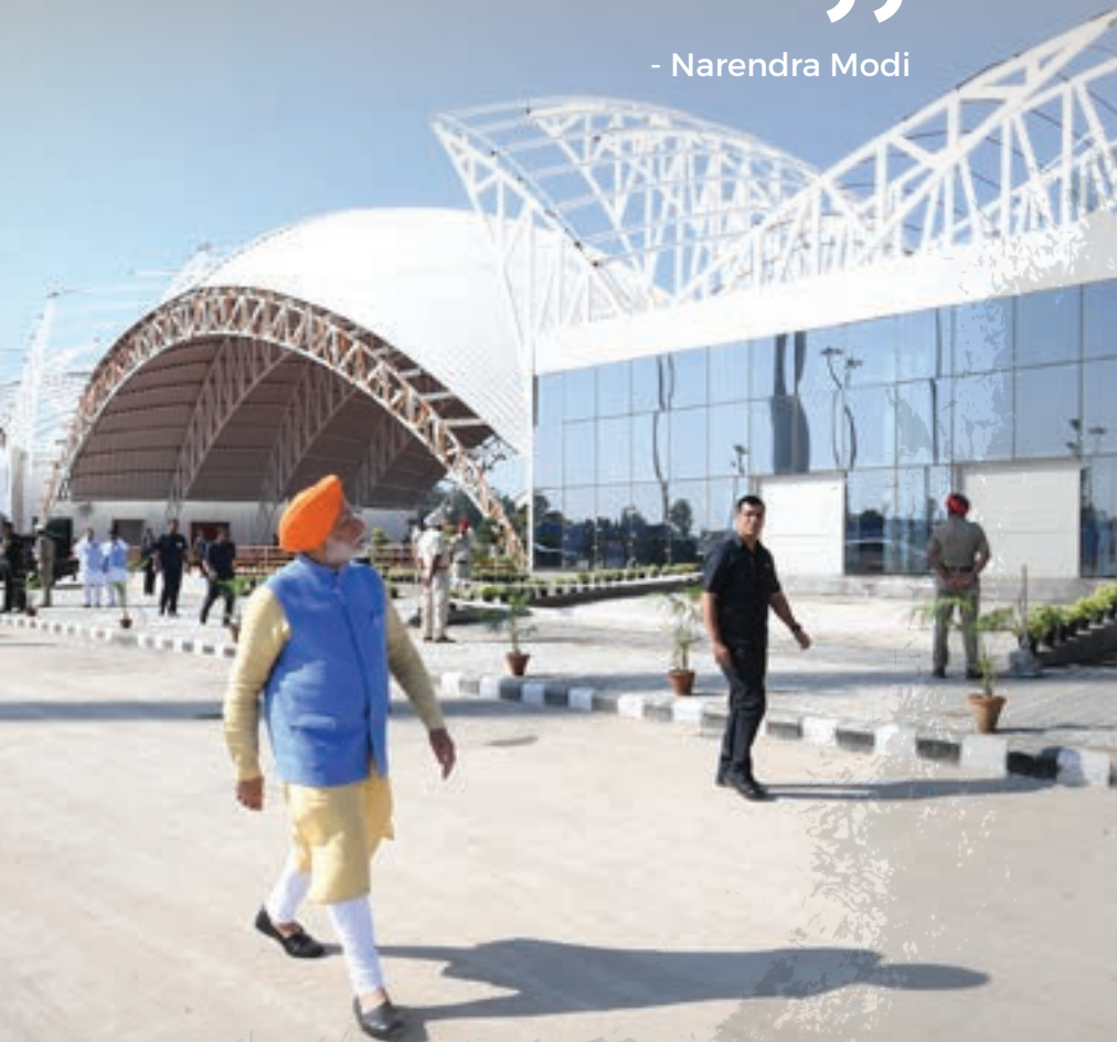
PM Modi inspecting the passenger terminal at Sri Kartarpur Sahib corridor