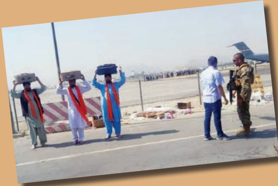
Three copies of the holy Shri Guru Granth Sahib Ji at Kabul airport on their way to be airlifted safely to New Delhi