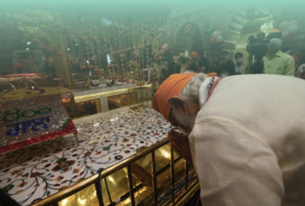
PM Modi offers prayers at the Gurudw ara Sis Ganj Sahib, Delhi, May 1, 2021