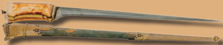
Iron Sword with the inscription in Persian mentioning the name of the Sixth Sikh Guru Shri Hargobind Das (Origin - Punjab; 18th CE).The sword was brought back to India during Prime Minister Narendra Modi's visit to the US in September 2021.