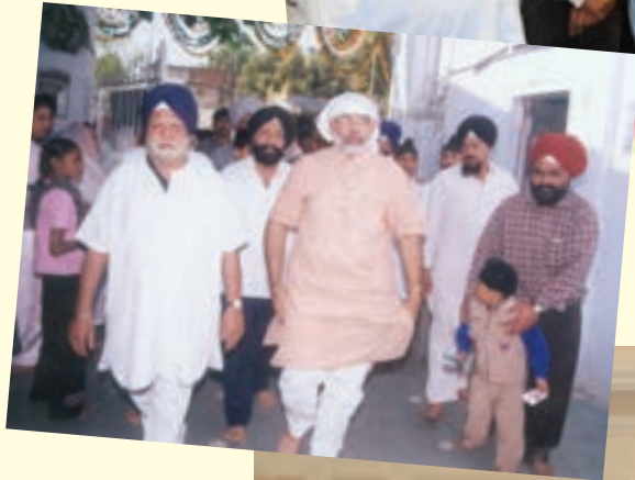
Narendra Modi on a visit to a gurdwara for a community event during his tenure as Chief Minister of Gujarat