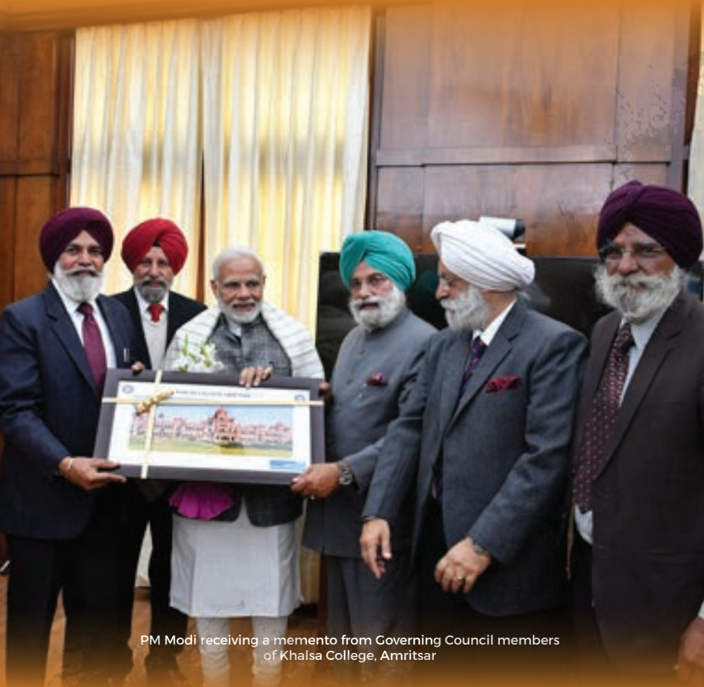
PM Modi receiving a memento from Governing Council members of Khalsa College, Amritsar