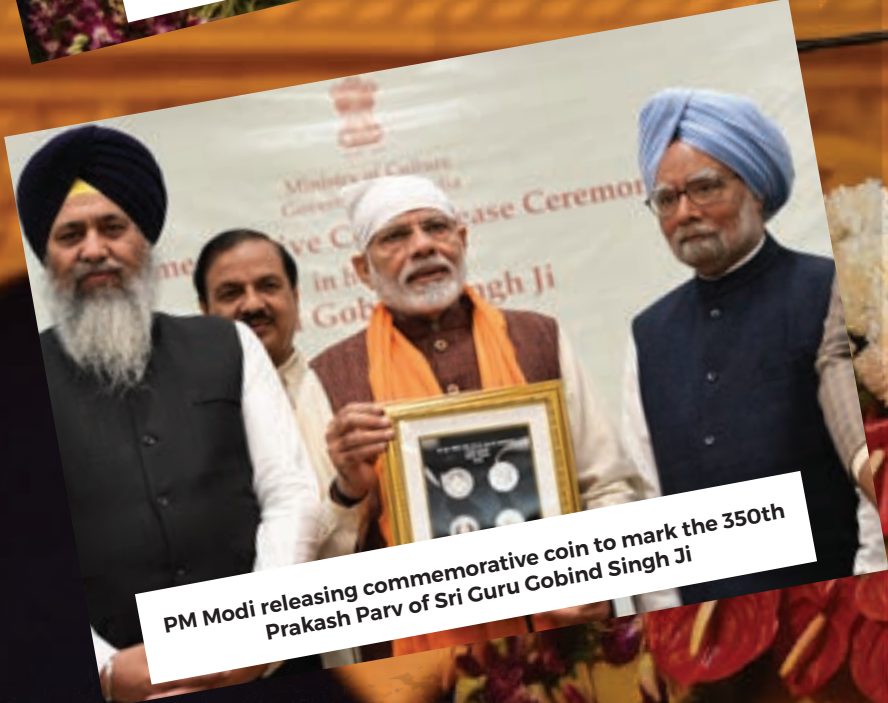
PM Modi releasing commemorative coin to mark the 350th Prakash Parv of Sri Guru Gobind Singh Ji