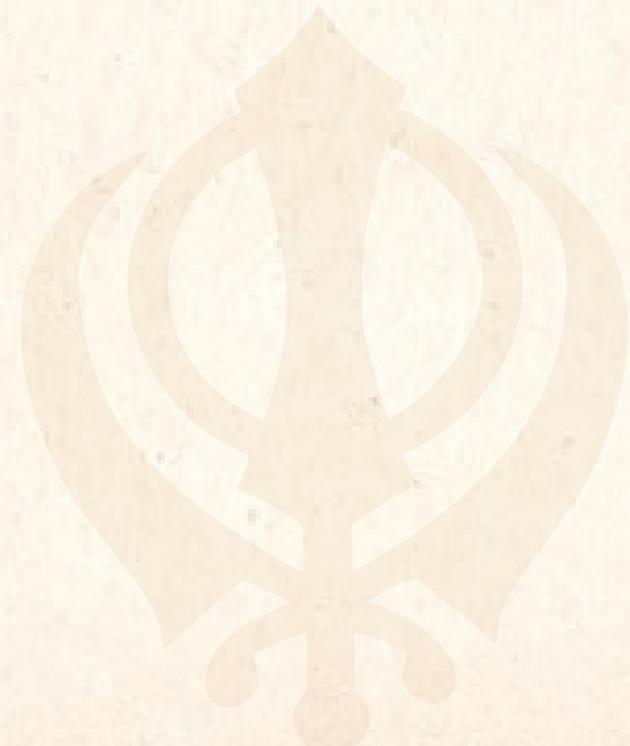
Operation Devi Shakti to bring back Afghan Sikhs and stranded Indians safely to India

India continues to be in touch with remaining members of Sikh community in Afghanistan and committed to ensure their safety and security. The Government of India also actively pursues the issue of those Afghan Sikhs who desire to come to India.